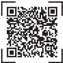
Download for Android